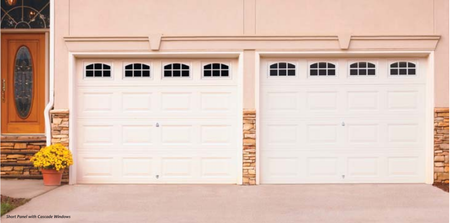
Short Panel with Cascade Windows

When it comes to ultimate protection, the Olympus stands tall. With triple-layer construction, a thermal seal, and superior insulation R-value of 15.67 or 11.04, these durable, low-maintenance doors give you the ultimate in quiet operation and energy efficiency.