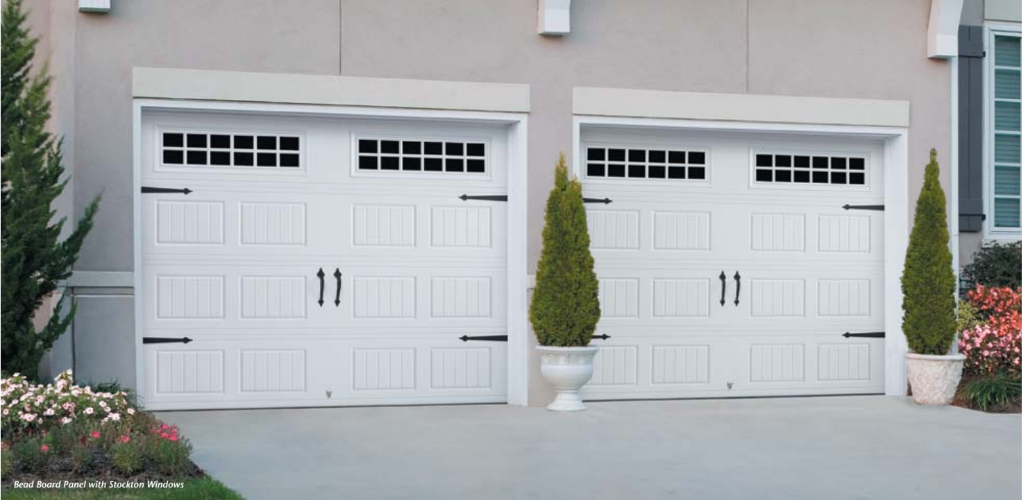
Bead Board Panel with Stockton Windows

Design and energy efficiency make the Designer's Choice doors popular models. With triple-layer construction, a thermal seal, and superior insulation R-value of 15.67 or 11.04, these durable, low-maintenance doors give you the ultimate in quiet operation and energy efficiency.