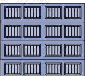
SP • BEAD BOARD