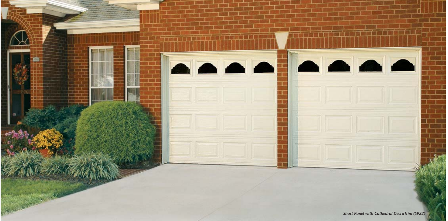
Short Panel with Cathedral DecraTrim (SP22)

Tradition never goes out of style. Choose from four different panel designs to create the steel garage door you always wanted. The Heritage Collection of traditional designs provides a low-maintenance heavy gauge steel door. Amarr's section interfaces are designed to reduce the risk of serious finger and hand injuries. The Heritage Collection. Great looks for years to come.